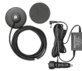
Soft Install Kit 318406*